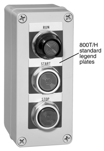
Bul. 800H - 30.5 mm Push Button Enclosure