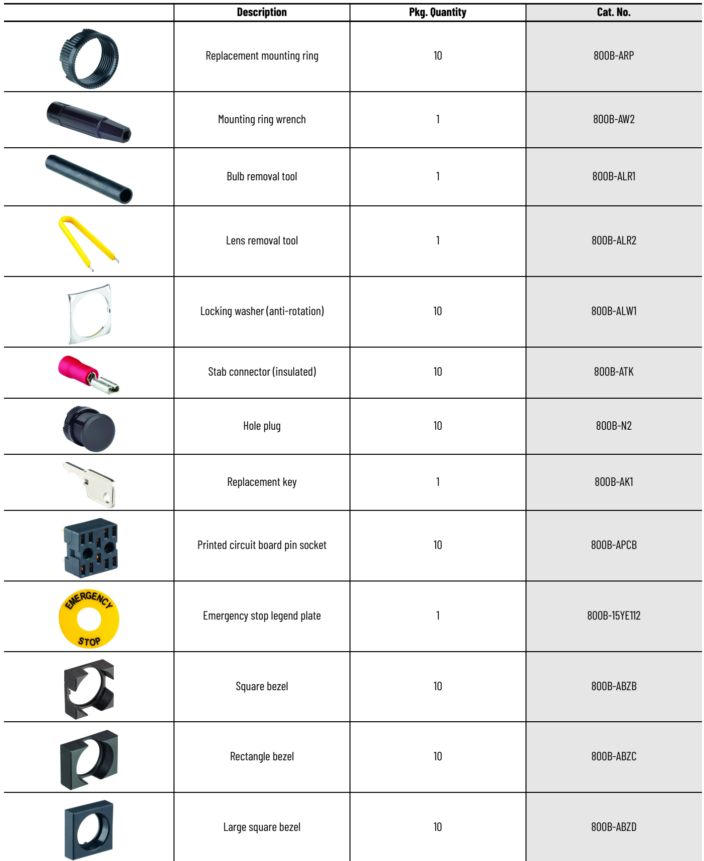
Table 50 - Accessories