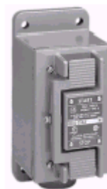
Car. No. 800S-2SA4