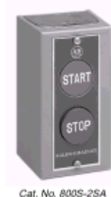
Cat. No. 800S-2SA

Two pushbutton station shown less buttons